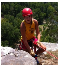
Venture Quest 2012