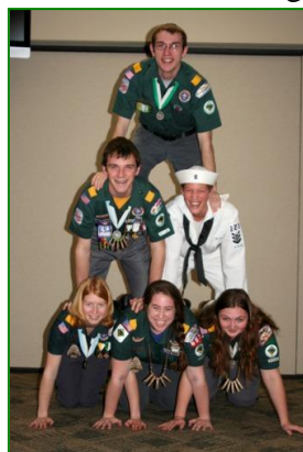
Area 3 Venturing V.O.A. Supporting Our Central Region Venturing President